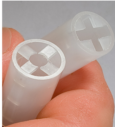
Both ends can be used.