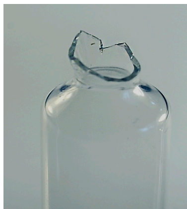
AmpSnap®, for clear cuts. Protects from sharp damaging glass edges.

By using AmpSnap®, you reduce the risk of cuts when breaking ampoules.