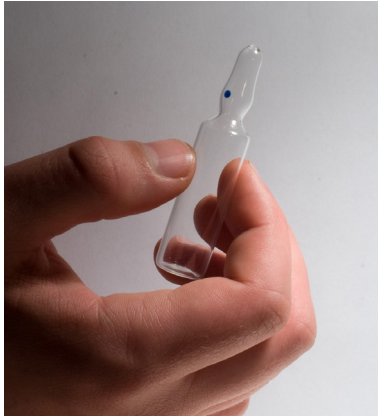
AmpSnap® fits ampoules from 1-10 ml.