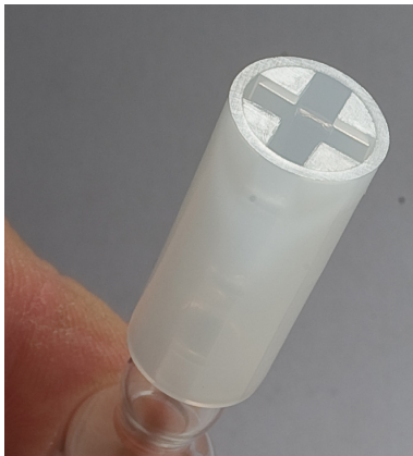
Push either one of the AmpSnap® ends completely over the ampoule neck and snap at the scored line, if present.

Many users break ampoules by simply using swabs or gauze pieces which puts them at risk of cuts from sharp edges.